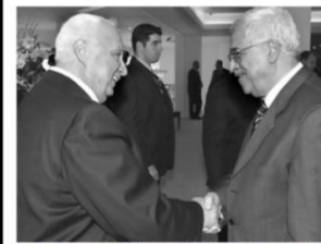
Israel Prime Minister Ariel Sharon (L) shakes hands with Palestinian President Mahmoud Abbas during their meeting at Sharm el-Sheikh.

The gestures on both sides reflect a dramatic brightening of prospects for Middle East peacemaking since the death of Yasser Arafat and the advent of Mahmoud Abbas.