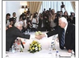
Palestinian President Mahmud Abbas and Israeli Prime Minister Ariel Sharon shake hands at summit in Egypt where they announced a ceasefire between the two sides.

SHARM EL-SHEIKH, Egypt, Feb 8 (MASNET & News Agencies) - Israeli Prime Minister Ariel Sharon and Palestinian leader Mahmud Abbas announced a ceasefire, calling for a halt to four years of violence and bloodshed, allowing for peace talks to get back on track.